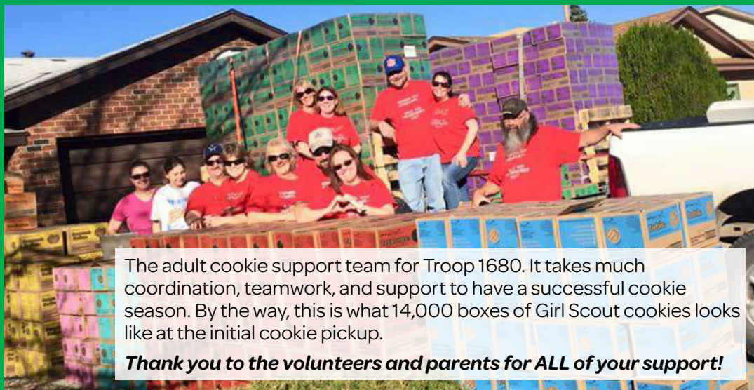
The adult cookie support team for Troop 1680. It takes much coordination, teamwork, and support to have a successful cookie season. By the way, this is what 14,000 boxes of Girl Scout cookies looks like at the initial cookie pickup.

Thank you to the volunteers and parents for ALL of your support!