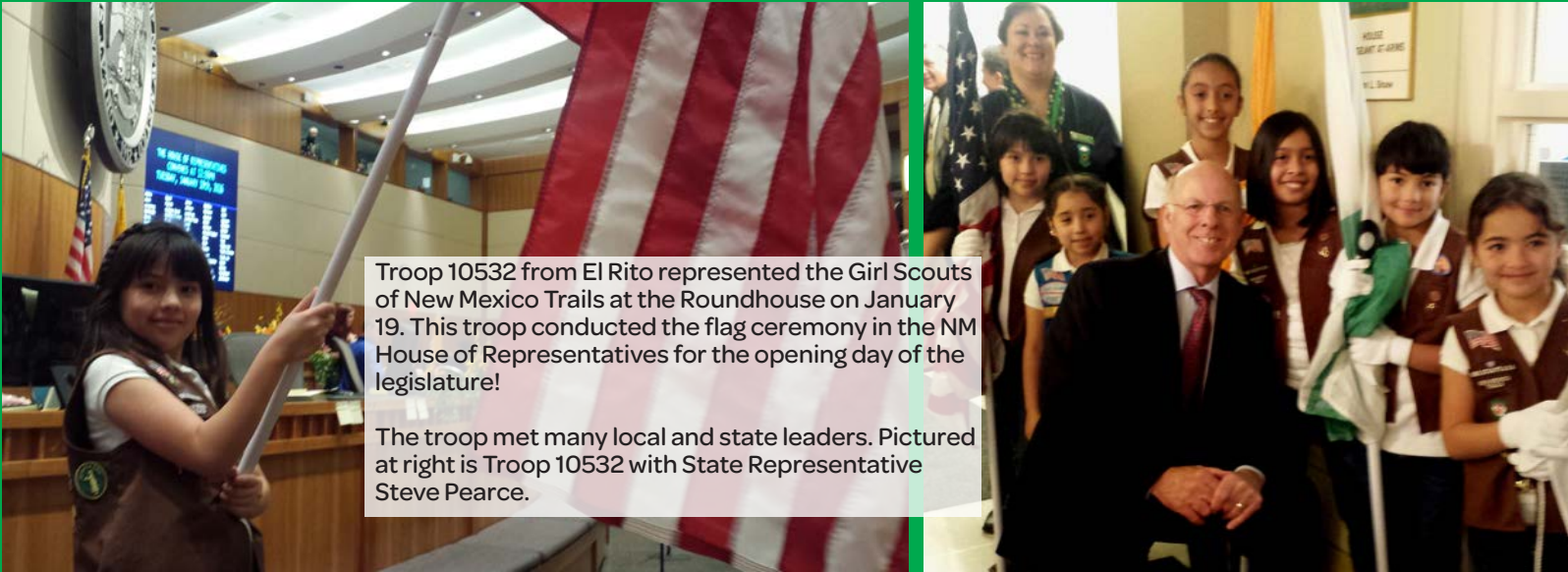
Troop 10532 from El Rito represented the Girl Scouts of New Mexico Trails at the Roundhouse on January 19. This troop conducted the flag ceremony in the NM House of Representatives for the opening day of the legislature! The troop met many local and state leaders. Pictured at right is Troop 10532 with State Representative Steve Pearce.