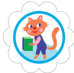
Cookie Goal Setter