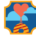
My Cookie Business Resume