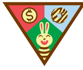
My Cookie Customers