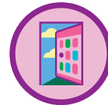
My Cookie Team