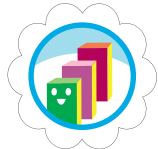
My First Cookie Business

Earn one of the Cookie Business badges to help you discover new skills. Each badge has digital marketing skills built right in.