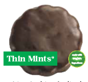
Crispy chocolate wafers dipped in a mint chocolaty coating