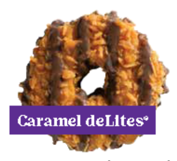
Crispy cookies topped with caramel, toasted coconut, and chocolaty stripes