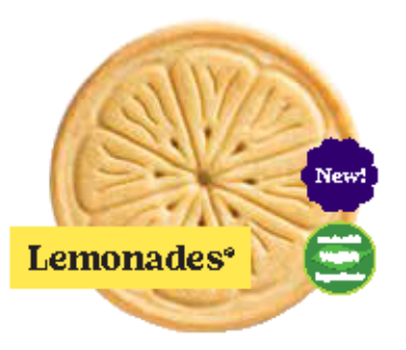
Savory slices of shortbread with a refreshingly tangy lemon flavored icing