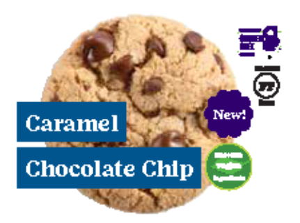
Caramel, semi-sweet chocolate chips, and a hint of sea salt in a delicious cookie* *Umited availas 1819