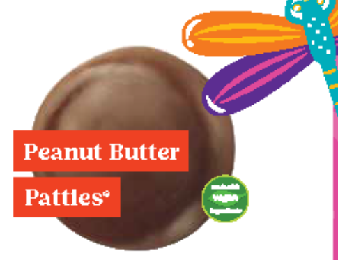
Crispy cookies layered with peanut butter and covered with a chocolaty coating