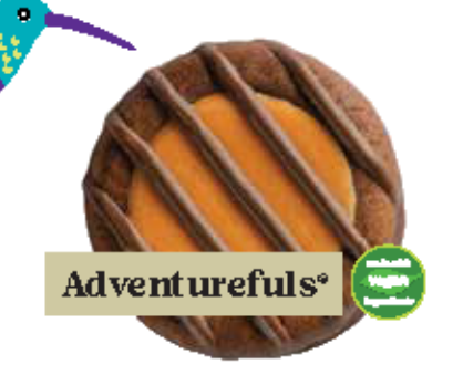
Indulgent brownie-inspired cookies with caramel flavored crème and a hint of sea salt