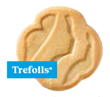
Iconic shortbread cookies inspired by the original Girl Scout recipe